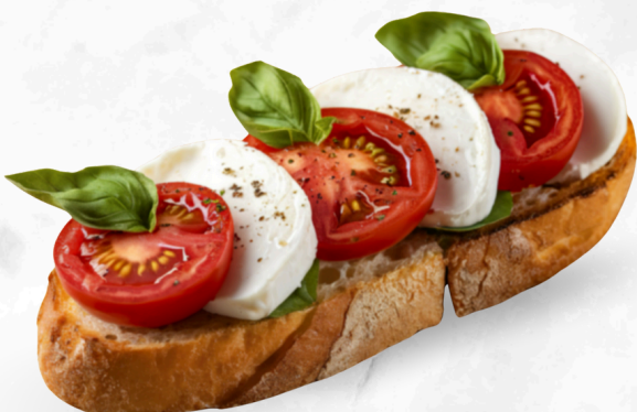
CHEESE & TOMATO BRUSCHETTA 23 AED Toasted bread with fresh tomatoes, cheese, olive oil, and basil