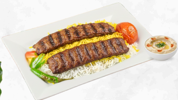
IRAQI KOOBIDEH KEBAB 35 AED

Chargrilled minced beef or lamb with traditional spices.