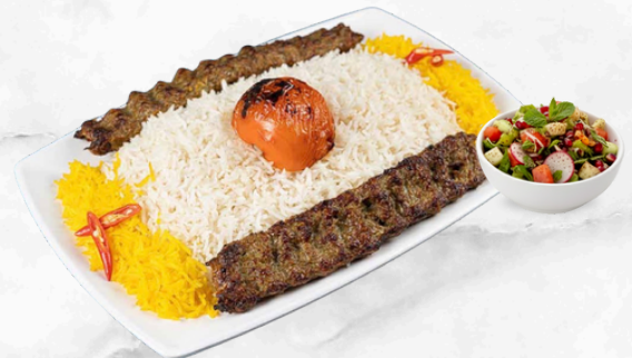
KOOBIDEH KEBAB 34 AED

Thick-cut beef marinated in yogurt and spices, grilled tender and juicy.