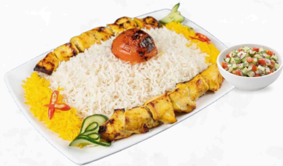
SAFFRON CHICKEN KEBAB 32 AED

Tender chicken marinated with saffron, grilled for a rich aroma and flavor.