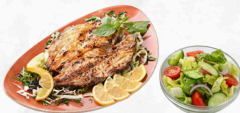
SUPREME FISH Premium fish fillet, perfectly seasoned and cooked.

Premium thin-sliced beef fillet, marinated and flame-grilled.