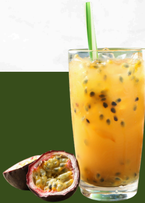
Passion Fruit Mojito