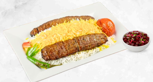
BARG KEBAB 50AED - 63 AED

Spiced minced meat kebab with a rich Iraqi-style flavor.