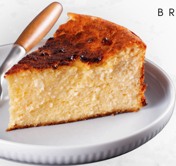
SAN SEBASTIAN CHEESECAKE