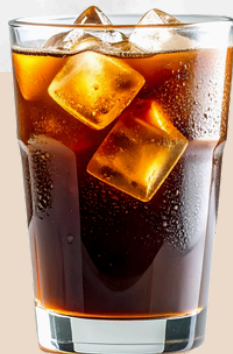
Cold Brew Coffee