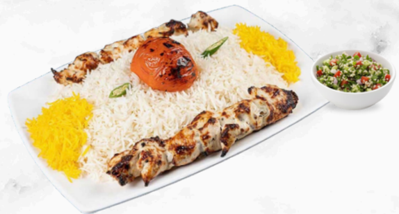
LARI CHICKEN KEBAB 34 AED

Tender chicken marinated with saffron, grilled for a rich aroma and flavor.