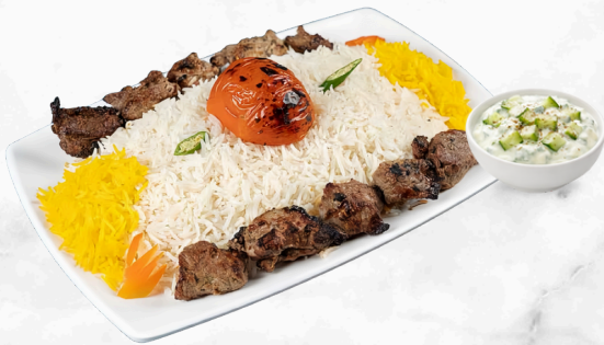
LARI BEEF KEBAB 39 AED

Yogurt-marinated chicken, grilled for a soft texture and rich flavor.